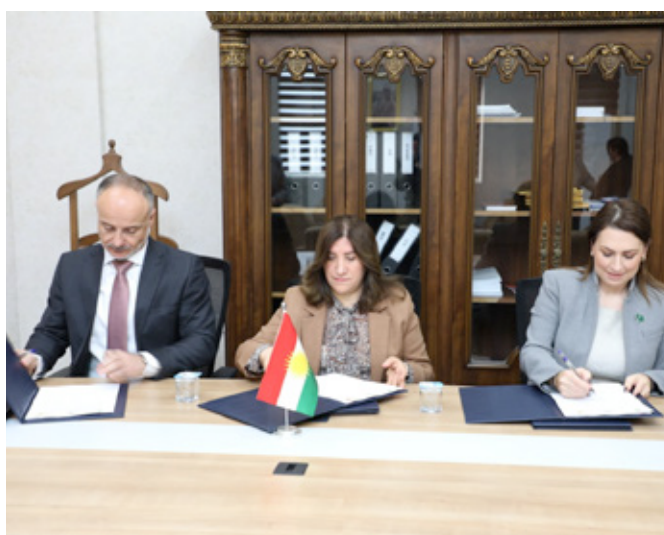
SEED Signs an MOU with MOLSA to establish and activate the GBV Sector Coordination Group, Erbil, Iraq, 2022