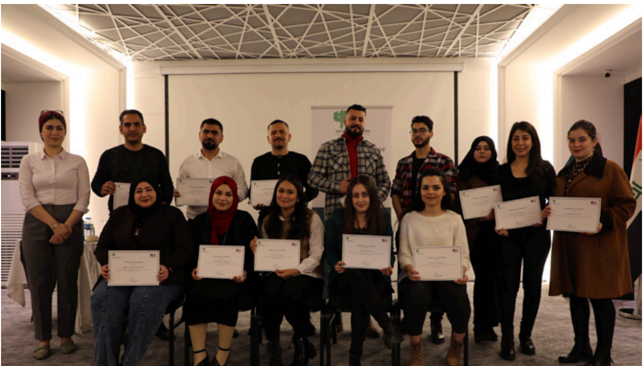
NGOs training graduation | Erbil, Iraq, 2023